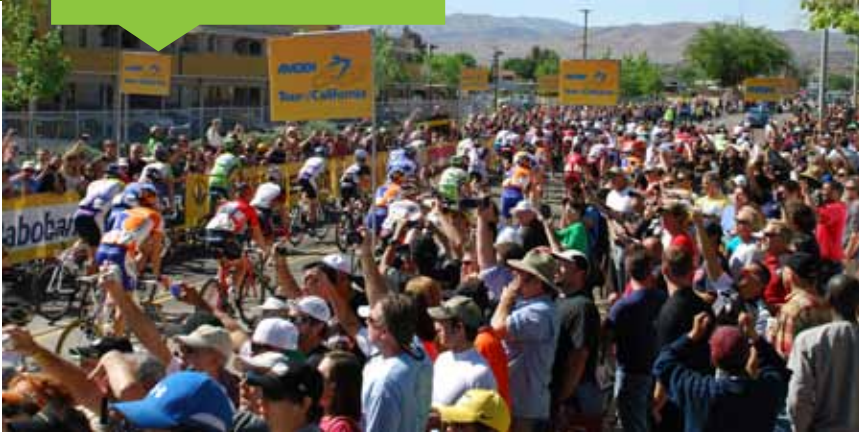
Palmdale celebrates the 2010 stage start.